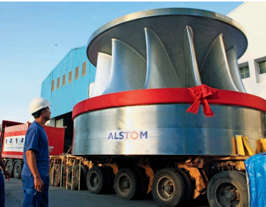
Biggest Francis Turbine Runner ever manufactured in India at Alstom Hydro Vadodara Workshop