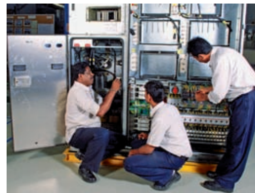
Auxiliary Block at Coimbatore Site