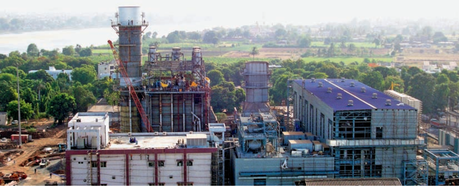
Utran site at Surat, Gujarat