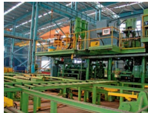
Waterwall Panel Welder with 6 Torch Configuration at Durgapur Workshop