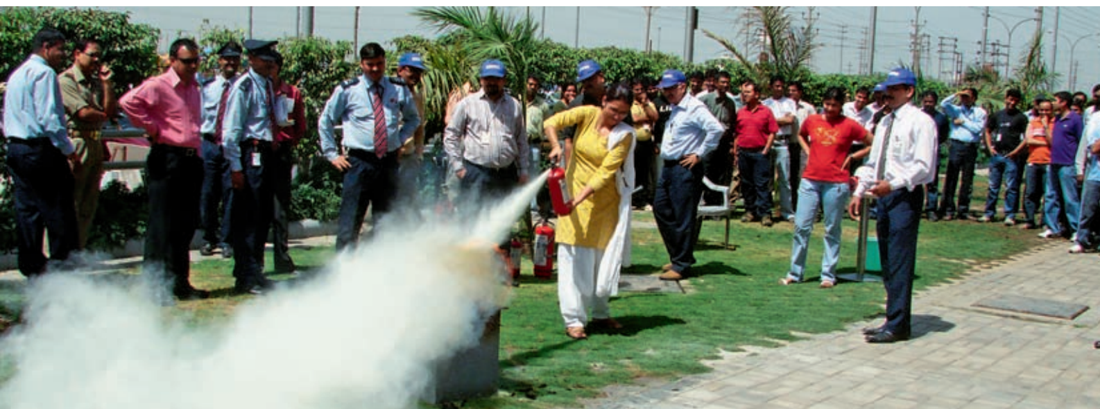
Training Program for employees on Environment, Health and Safety (EHS)