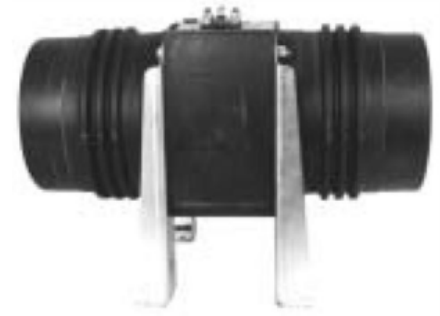
JCD-3 and JCD-4 Current Transformer

Wiring Diagram ... refer to page 41, figure 3