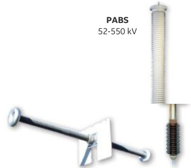
PWS 800 kV AC and DC applications

For more information please contact GE Power Grid Solutions