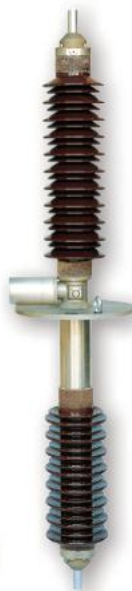
OIP AC Air to Air