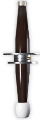
POBR 72.5-245 kV