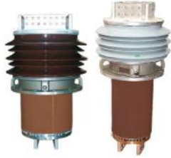
PTFR/PTHR oil-to-air high current 24-36 kV