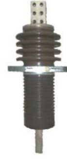
PGFR generator bushings up to 36 kV