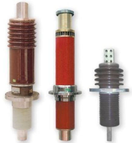
RIP generator bushings