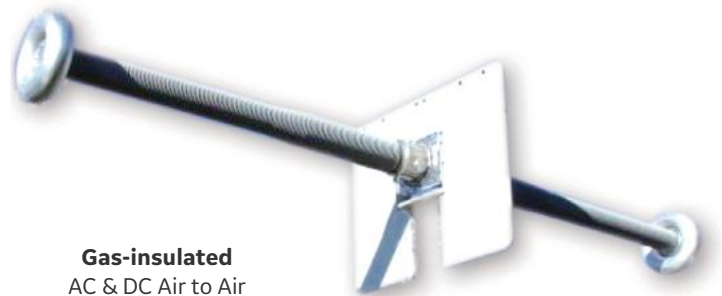
Gas-insulated AC & DC Air to Air