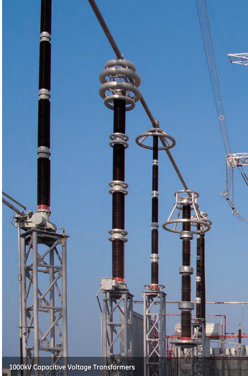
1000kV Capacitive Voltage Transformers