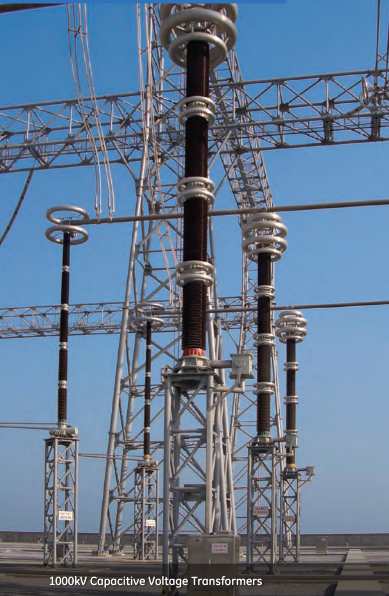
1000kV Capacitive Voltage Transformers