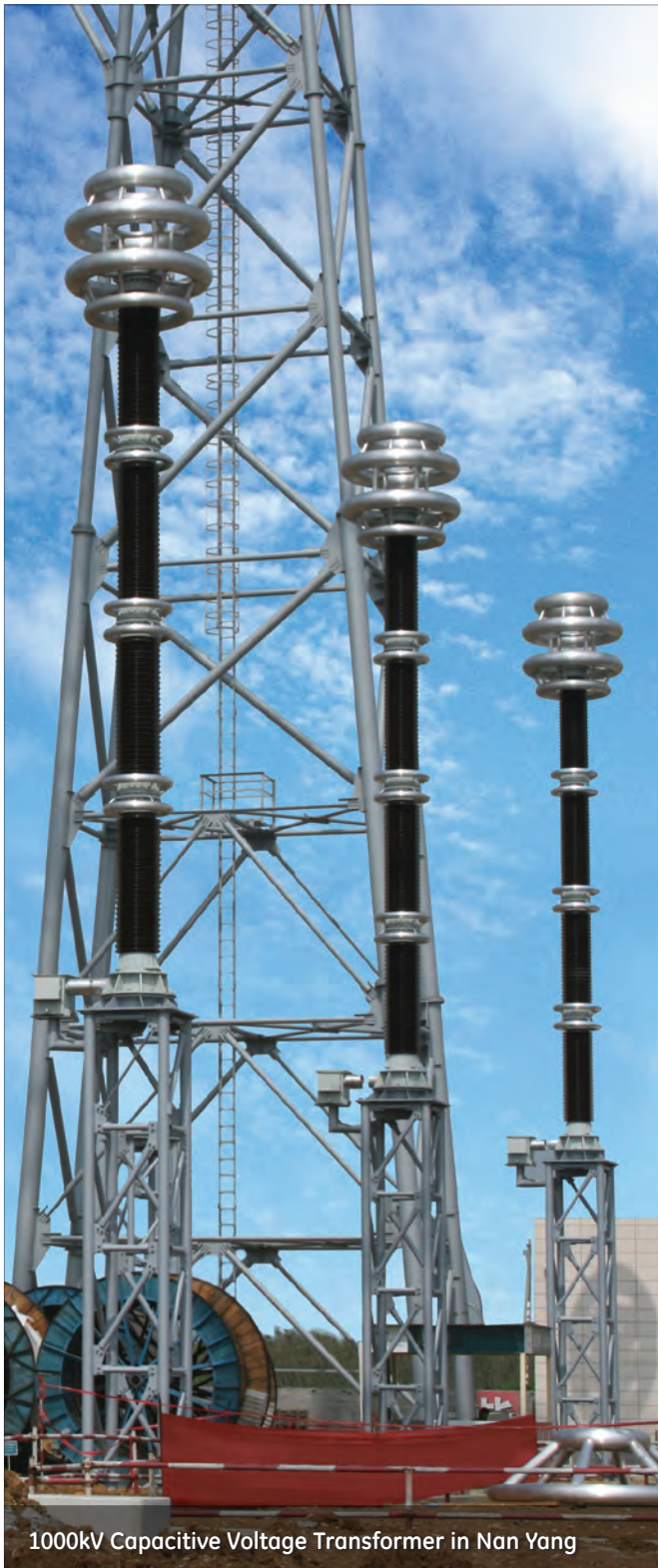
1000kV Capacitive Voltage Transformer in Nan Yang