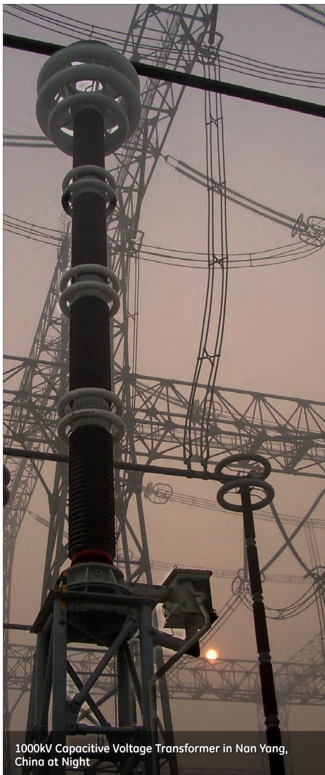
1000kV Capacitive Voltage Transformer in Nan Yang, China at Night