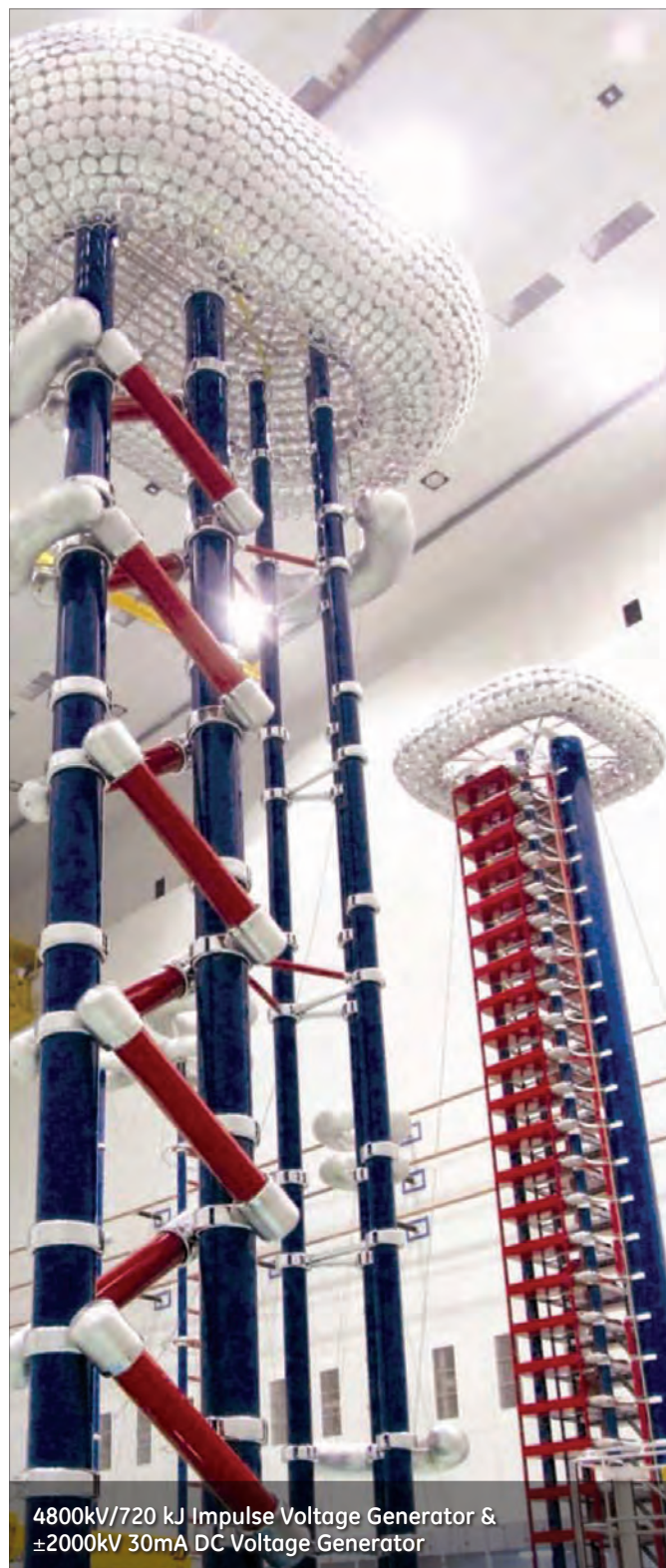
4800kV/720 kJ Impulse Voltage Generator & ±2000kV 30mA DC Voltage Generator