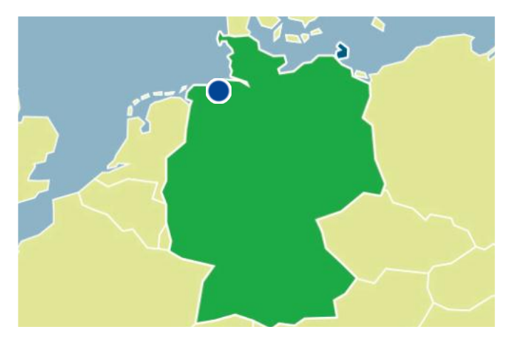
83 km Undersea HVDC Line to the Coast