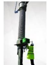
AIS CT up to 245 kV

Already, six (6) utilities have decided to implement g 3 solutions on their networks, and many others are now considering the new GE solution. The environmental argument for g 3 is staggering – SF 6 remains in the atmosphere for 3200 years, and its concentration has increased by 20 % in the past 5 years alone.