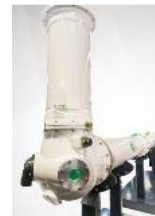
GIL up to 420 kV

g 3 is fully type-tested and commercially available for GIS up to 145 kV, GIL up to 420 kV, and AIS Current Transformers up to 245 kV.