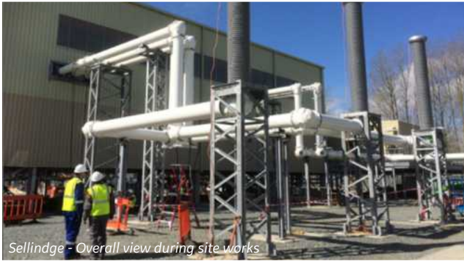
Sellindge - Overall view during site works

The entire electrical transmission industry is buzzing over the technical achievement of energizing the first high voltage gas-insulated line (GIL) using an environmentally friendly alternative to SF 6 . This SF 6 alternative insulation medium is called g 3 : Green Gas for Grid. To date, there has been no alternative to SF 6 technology since its inception in the 1970's, when it was introduced as an insulation medium in High Voltage (HV) switchgear.