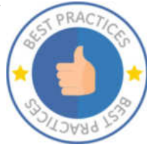
Utilities can adopt best practices in terms of environmental sustainability