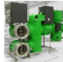
GIS up to 145 kV